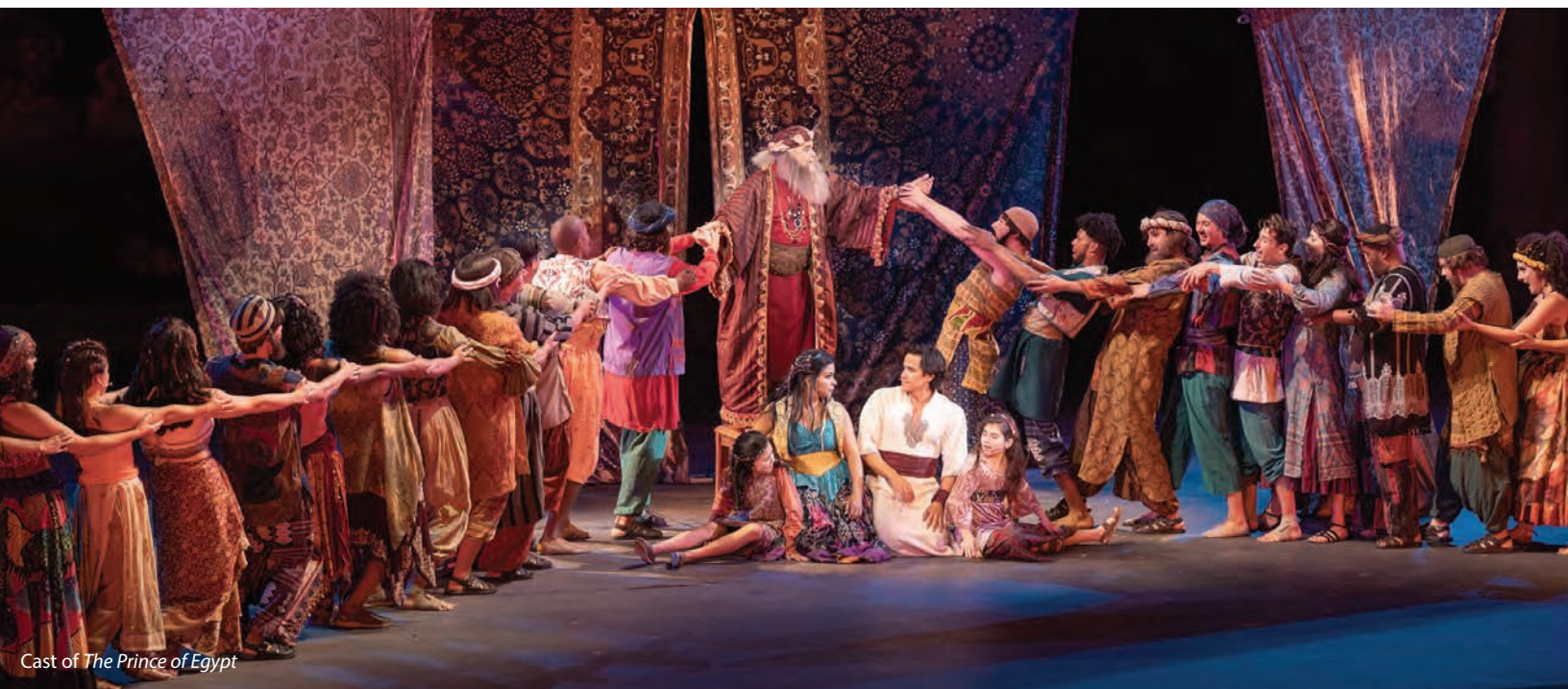
Cast of The Prince of Egypt

In 2018, Tuacahn presented the world premiere of The Prince of Egypt and one of the first regional premieres of Matilda .