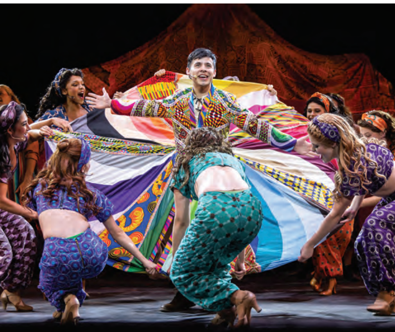
David Archuleta, 2022 Joseph and the Amazing Technicolor Dreamcoat