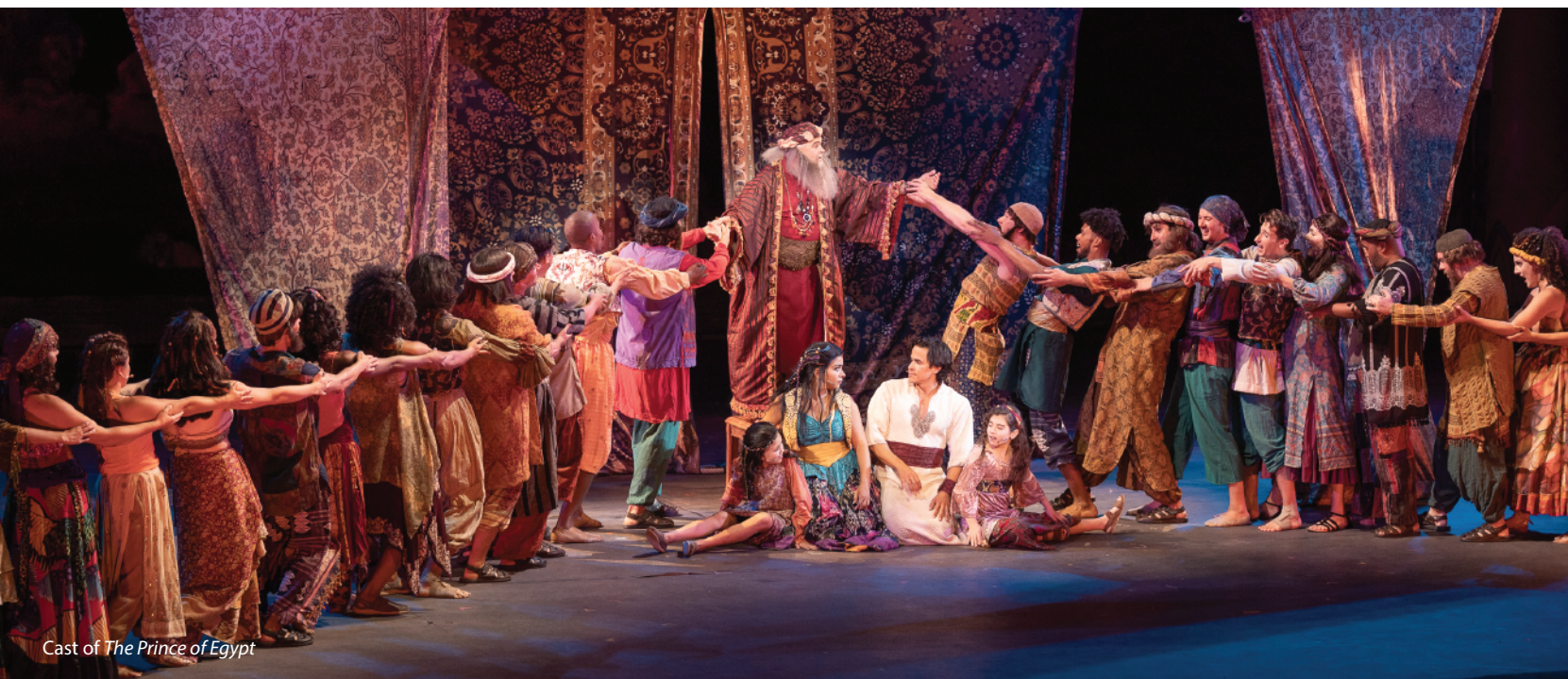
Cast of The Prince of Egypt

In 2023, Roald Dahl's Charlie and the Chocolate Factory and Beautiful: The Carole King Musical made their regional premiers at Tuacahn.