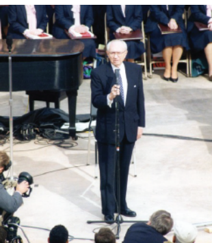
Gordon B. Hinckley, 15th President of The Church of Jesus Christ of Latter-day Saints dedicating the Amphitheatre

In 2021, Tuacahn celebrated 25 seasons, in which they produced more than 60 major musical theater productions, hosted more than 200 concerts, showcased hundreds of professional actors and musicians, educated thousands of students, involved thousands of community volunteers and seated over one million patrons.