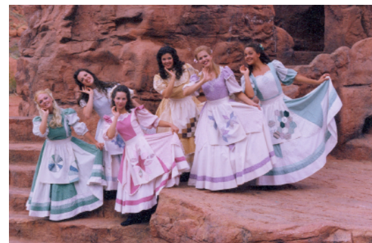
The 1999 cast of Seven Brides for Seven Brothers