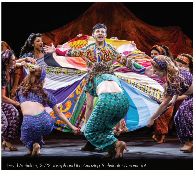
David Archuleta, 2022 Joseph and the Amazing Technicolor Dreamcoat